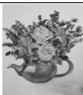
Flower T Pot Original Art

Nether Heyford & Guilsborough, Northampton